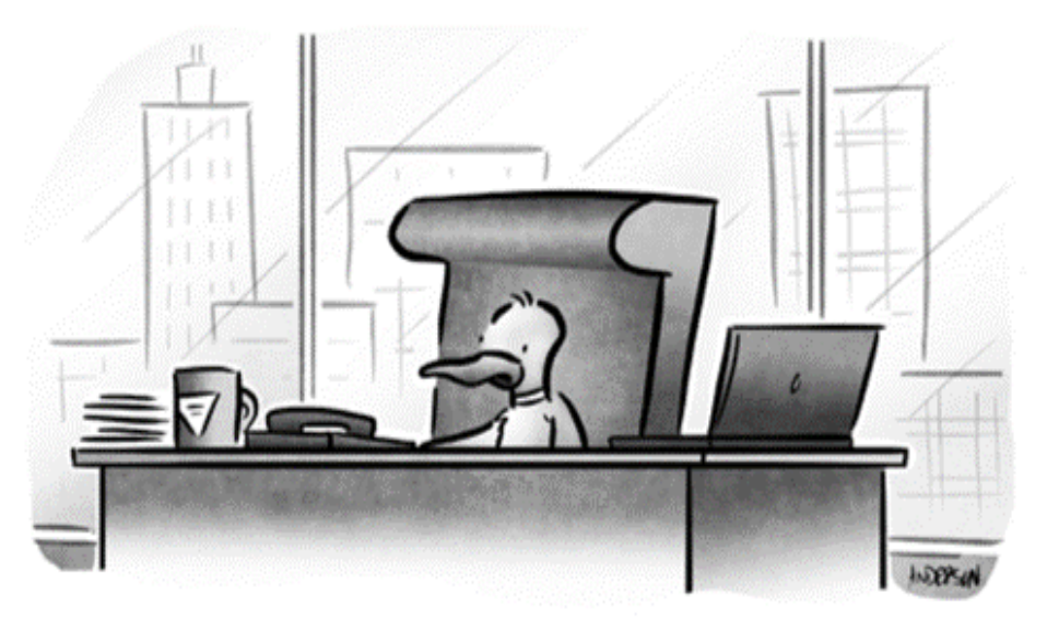
"Stephanie, would you please head down to that old lady in the park and bring me back some bread crumbs?"

cinema, this technique hides malware in the downloaded subtitle information for a movie. Once it's in your computer it takes root and communicates with the attacker. By the intermission, your machine belongs to them! If you're a Popcorn Time user, you can download the patch online. VLC and other media players should have the problem patched by the time of printing. Or, you know, you could just not download movies from the internet ... but we all know how likely that is. Techcrunch.com 5/24/2017