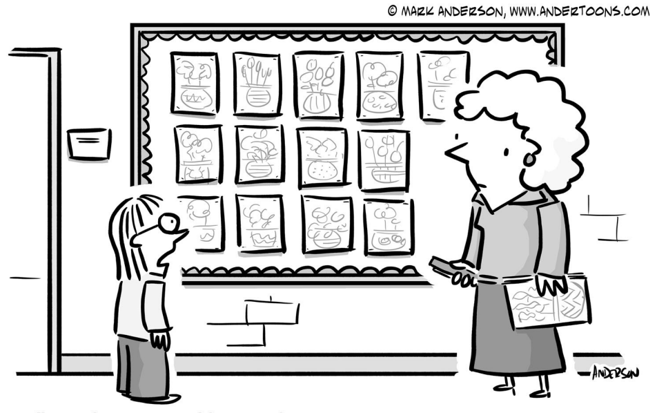
"You know, you'd get a lot more exposure on Instagram or Pinterest."

According to investment firm Piper Jaffray, there will be $5.4 billion worth of virtual reality devices on the market by 2025. The uses for small business are